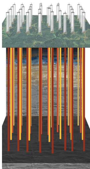
Traditional Vertical Well Spacing: 32 Separate Padsites Needed For 32 Wells. (Method not used by Chesapeake)

Throughout production, we retain only a small ongoing footprint. And once a given site is no longer productive, we stay to ensure that the wells are properly plugged, the equipment is removed, and the site is replanted with vegetation. The transition is seamless.